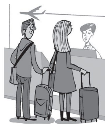
On 4th August they arrived at Heathrow airport. They checked in and waited for the plane to leave.