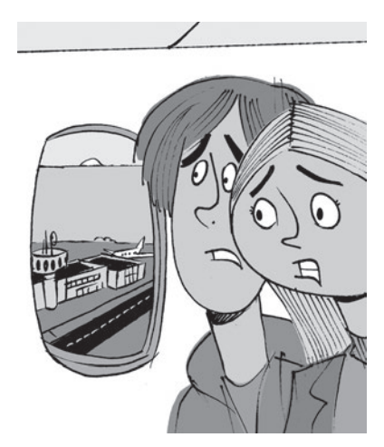
After only an hour the plane landed. They looked out of the window. It was a very small airport!