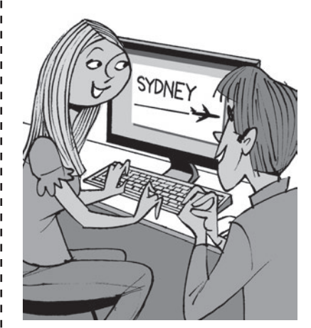
So, Raoul and Emma looked for cheap tickets on the internet. They booked two tickets to Sydney.