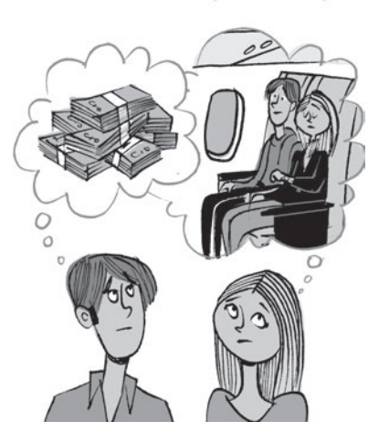
But it was a 24-hour journey by plane and tickets were very expensive.